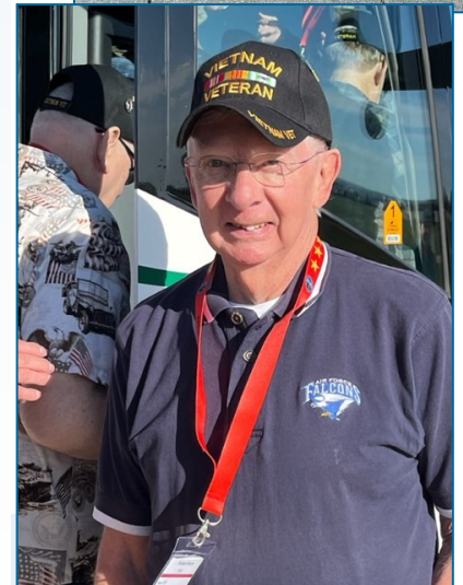
Boarding the bus

To learn more about the Honor Flight, visit honorflight.org or call 937-521-2400 with questions.