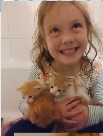
Ayla and kittens

If you would like to learn more about how to get involved in this service yourself, visit https://www.larimerhumane.org/get-involved/volunteer/foster/